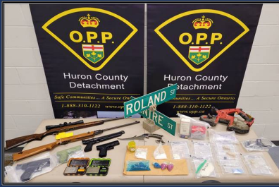
Figure 1- Seized Drugs & Weapons

The combined estimated street value of the seized controlled substances is $110,928 .